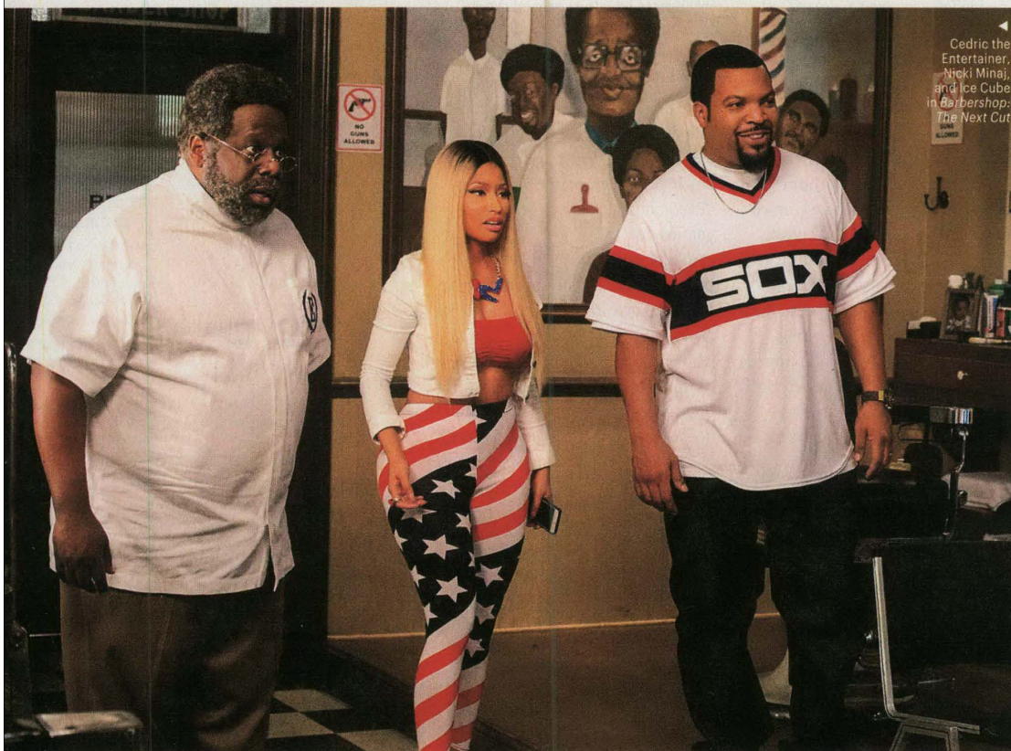
Cedric the Entertainer, Nicki Minaj, and Ice Cube in Barbershop: The Next Cut