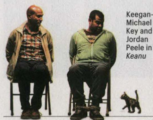
Keegan-Michael Key and Jordan Peele in Keanu