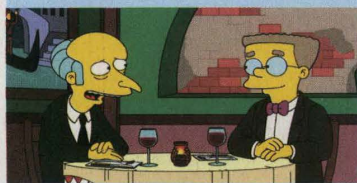
Mr. Burns and Smithers in the April 3 episode